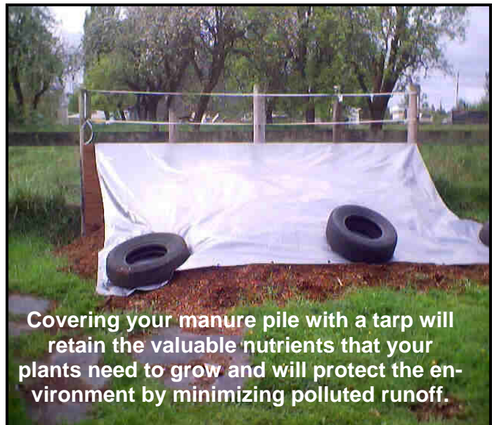
Covering your manure pile with a tarp will retain the valuable nutrients that your plants need to grow and will protect the environment by minimizing polluted runoff.