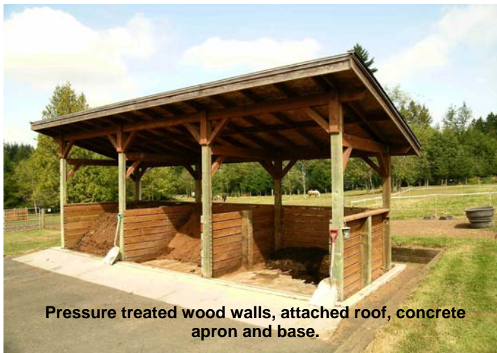
Pressure treated wood walls, attached roof, concrete apron and base.