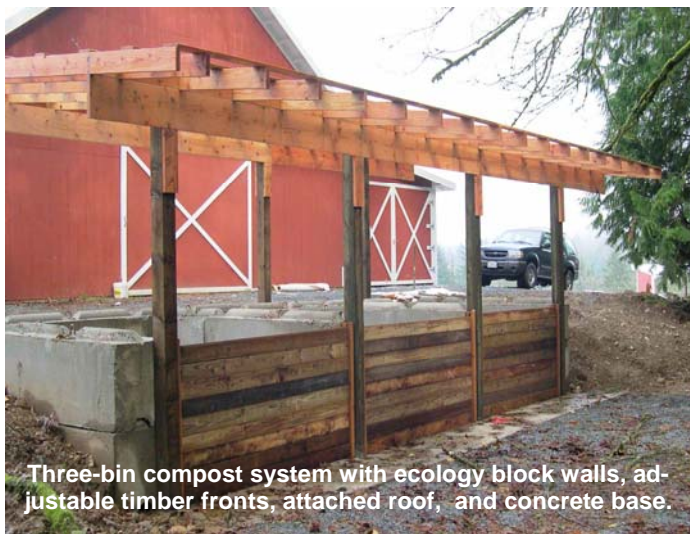
Three-bin compost system with ecology block walls, adjustable timber fronts, attached roof, and concrete base.