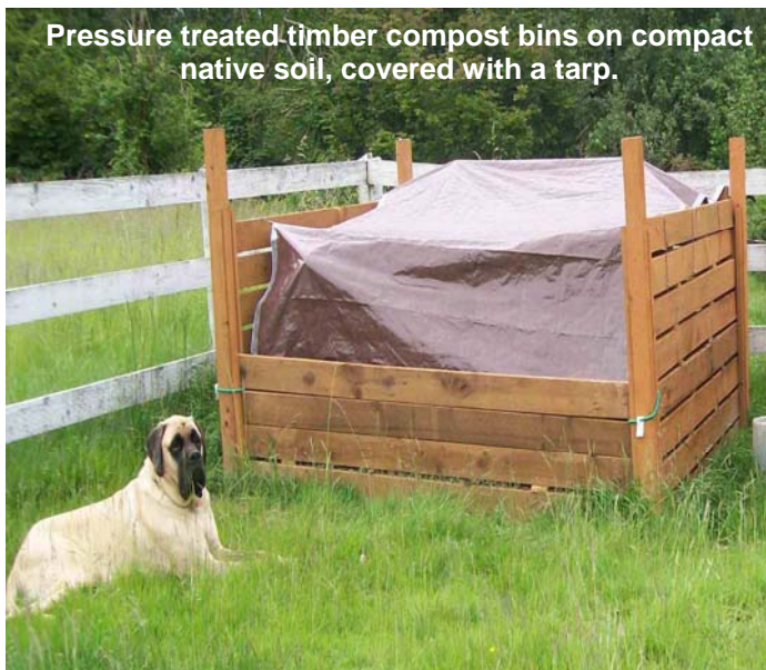
Pressure treated timber compost bins on compact native soil, covered with a tarp.