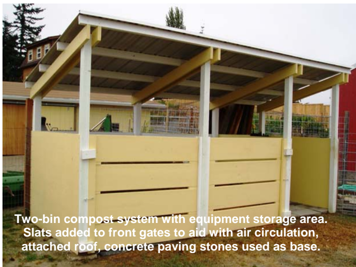
Two-bin compost system with equipment storage area. Slats added to front gates to aid with air circulation, attached roof, concrete paving stones used as base.