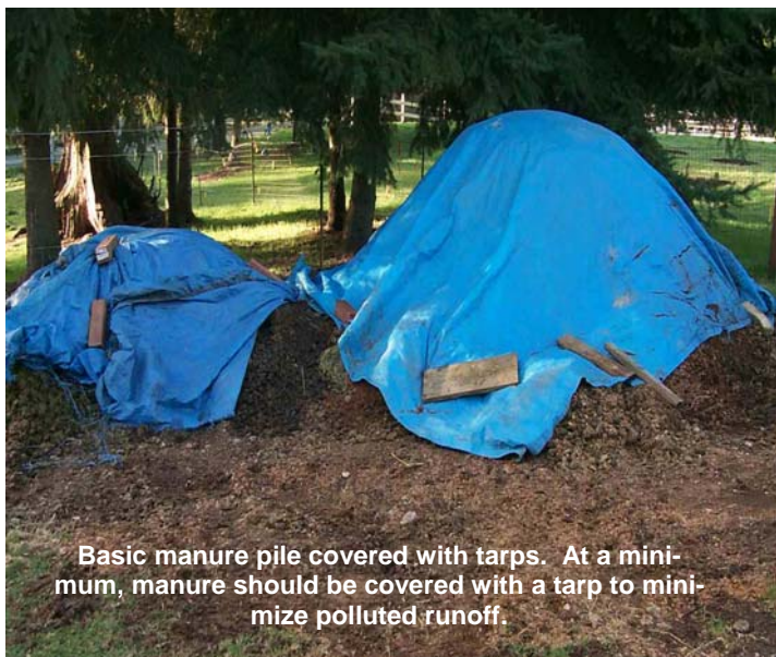
Basic manure pile covered with tarps. At a minimum, manure should be covered with a tarp to minimize polluted runoff.